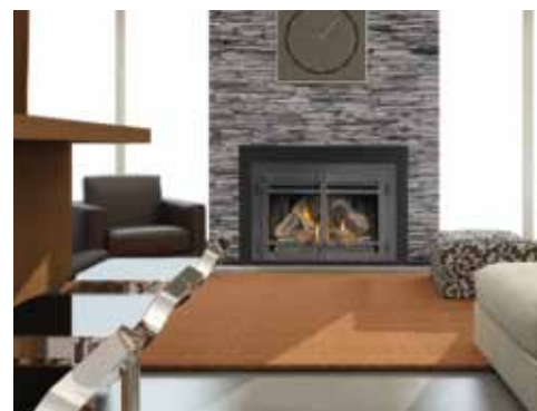
Above and Cover: XIR4 shown with five piece painted black surround, wrought iron door kit in painted black and Porcelain Reflective Radiant Panels.

Consult your owner's manual for complete installation instructions, accurate framing dimensions and proper clearances to combustible material. Check all local and national building code regulations. All specifications are subject to change without prior notice due to on-going product improvements. Products may not be exactly as shown. Napoleon® is a registered trademark of Wolf Steel Ltd. © Wolf Steel Ltd.